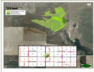
MAP SHOWING A PORTION OF THE PAWNEE WATERSHED TAMARISK TREATMENT SITE.

In the fall of 2006, in cooperation with the Kansas Water Office, Kansas Department of Agriculture, and Finney County Weed Department, the State Conservation Commission (SCC) began treating Tamarisk in the Pawnee watershed and areas north of Garden City. A total of 135 acres were treated at an estimated project cost of $33,750.