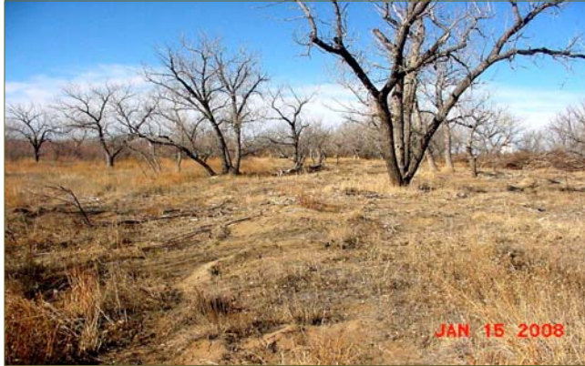
RESULTS OF TAMARISK CONTROL EFFORTS AT COTTONWOOD FLATS NEAR COOLIDGE. TAMARISK WAS REMOVED FROM THE UNDERSTORY OF THESE DORMANT COTTONWOODS.

nearly impenetrable growth of tamarisk. Cottonwoods and some native vegetation can be found, as well.