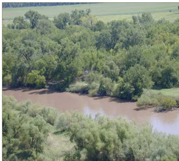
TAMARISK INFESTATION ALONG THE ARKANSAS RIVER.

the interconnected alluvial and High Plains aquifers along the Arkansas River where tamarisk has become a significant problem.