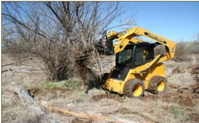
"JAWZ" ATTACHED TO A JOHN DEERE 250 SKIDSTEER MACHINE EXTRACTING A TAMARISK PLANT, WITH ROOT.