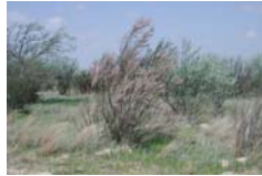
TAMARISK IN FLOWER. A MATURE TAMARISK CAN PRODUCE 1/2 MILLION SEED EACH YEAR.

Tamarisk (salt cedar) is a non-native invasive plant species that crowds out native vegetation, changes stream morphology, and affects both water quantity and quality. In Kansas, Tamarisk is present across the state, but is mainly located along western rivers and streams.